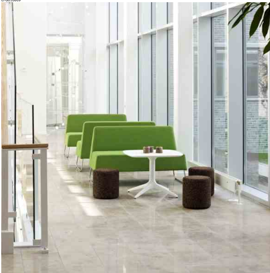
Table, height 520 mm