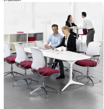
Table, height 720 mm