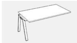
INCA16+ Workstation extension