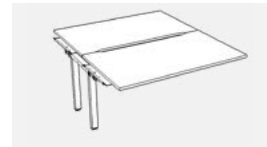
INCAB16+ Bench extension